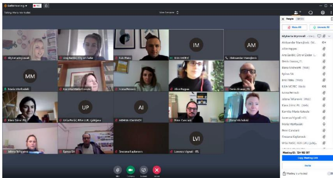
3rd project meeting day 2