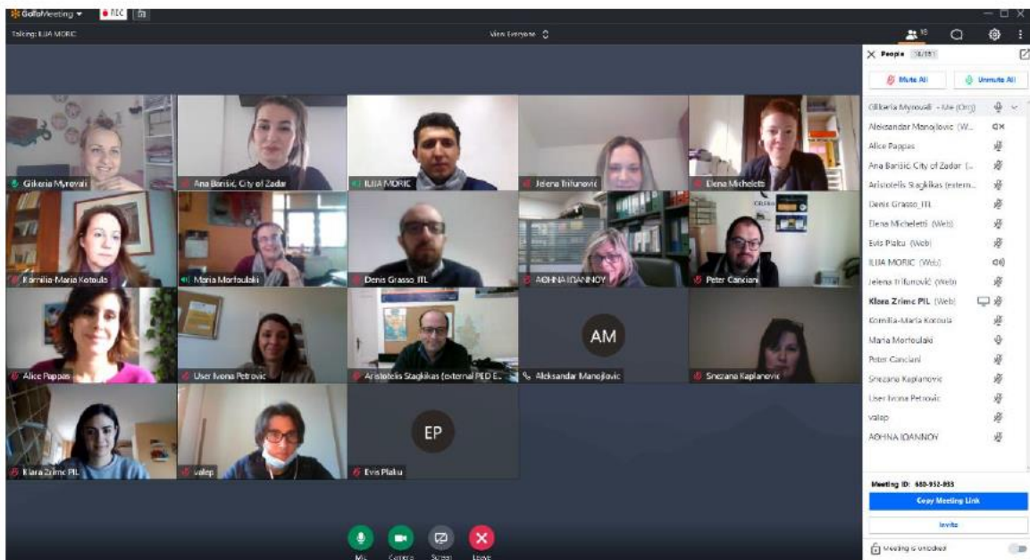
3rd project meeting day 1

On 16 and 17 February 2021, the third SUSTOURISMO project meeting took place online due to Covid-19 restrictions. The meeting was the occasion for discussing the advancements of the project's activities, focusing in particular on the main results of the first scientific and data collection activities aimed to support the development of the SUSTOURISMO touristic App and the local touristic packages and rewards systems to be tested during Summer 2021. Hopefully, the current sanitary emergency will rapidly improve as it is strongly affecting all economic sectors, tourism in particular.