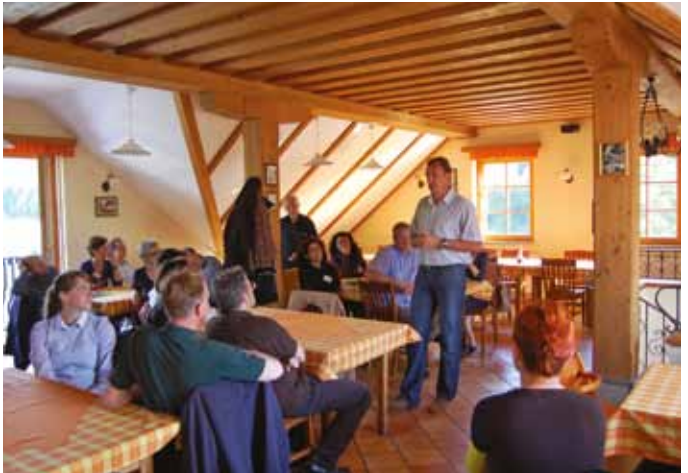
Meeting with the Mayor of Brezovica

The highlight of the first day was the site visit to the southern part of the Ljubljana Urban Region. The area is characterized by Ljubljansko barje, a moorland that was recently declared a landscape park, a large part of which is a protected natural area as part of the Natura 2000 network. The area is a subject of intense suburbanization in the last