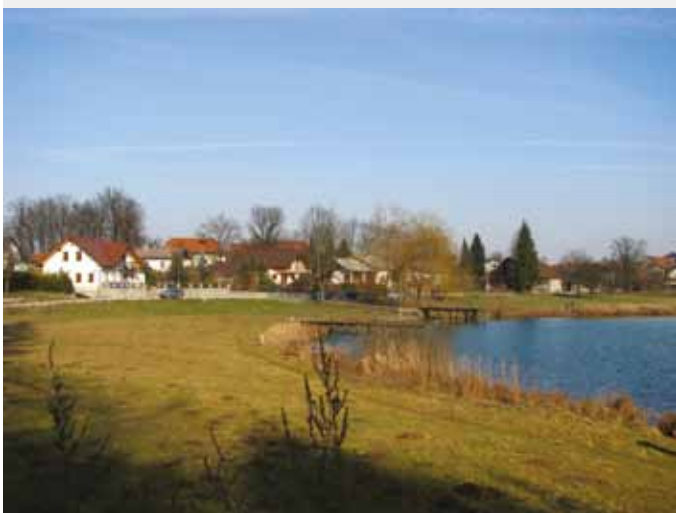
Jezero (Podpeč Lake)

The second day of the workshop started with the presentations of the related projects. Didier Vancutsem presented the URBACT LUMASEC project, dealing with land use in metropolitan areas, and Peter Austin presented the EUROCITIES project on cooperation within Metropolitan areas. Mr. Austin emphasized that the mismatch between formal boundaries and urban realities are increasing. Functional areas are advocated as an appropriate spatial level for effective integrated approaches to sustainable development, where cooperation builds on the relative strengths and inherent value of its different constituent parts. Tor Bysveen presented the practical case of cooperation within the metropolitan region on the case of Oslo. Mr. Bysveen presented the institutional structure of the Oslo –