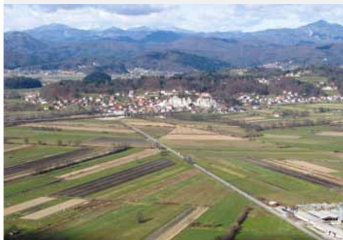
Municipality of Brezovica

We have recently established two new lines of Ljubljana public transport (LPP) between the two municipalities, together with providing adequate parking spaces. In addition to that, we have also modified and improved the parking spaces at three