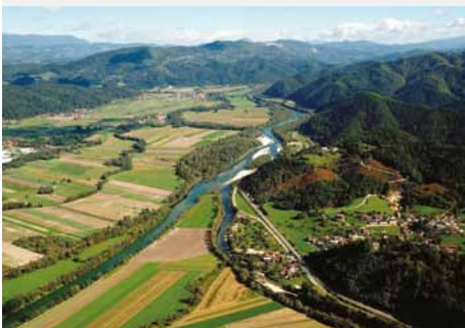
Dol pri Ljubljani, Region

cooperate and have successful territorial management. Within the project the discussion focused on different spheres of cooperation in the participating Metropolitan Regions: joint decision-making, joint transport companies, joint planning and joint financing.