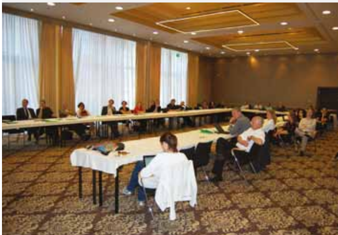
Day 2 – presentations of the related projects

Akershus metropolitan region and Planning and Building Act (2010) in relation to governance.