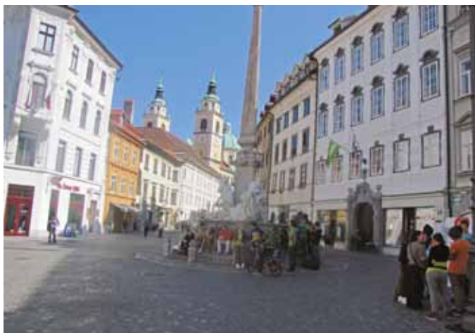
Event within the mobility week 2012

European Mobility Week ends every year on September 22 with a Without My Car Day, when