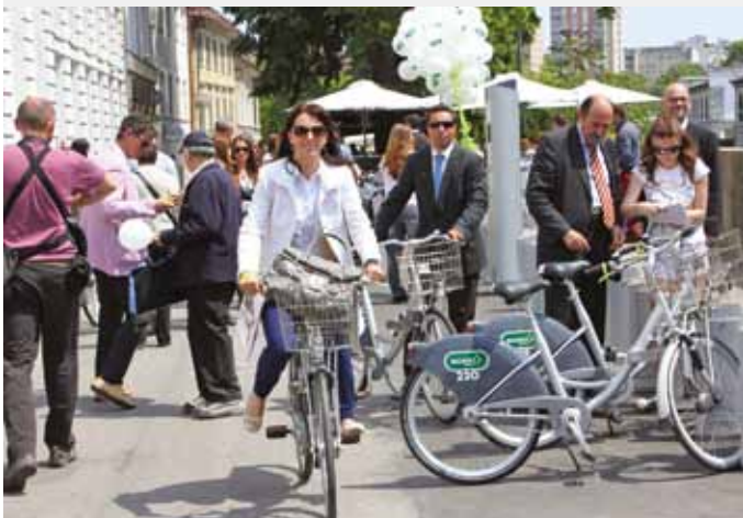
Urban bicycle system

and is the fastest and cheapest means of transport in the city centre. Bicycles can be hired at one of 31 rental stations and returned after use to any one of them. The rental stations are in the city centre; the service is available 24 hours a day.