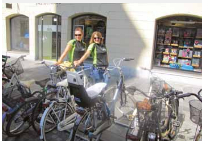
Event within the mobility week 2012

European Mobility Week is the most widespread campaign on sustainable mobility, and the Municipality of Ljubljana took part for the eleventh consecutive year. European Mobility Week 2012 took place from September 16 to 22; the central theme of this year's campaign was 'Moving in the right direction'. In Ljubljana, the following organisations, among others, participated in the preparation of