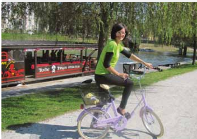
Event within the mobility week 2012

During this period, Slovenska Street was closed between Šubičeva and Gosposvetska streets. Traffic was allowed only for public buses, cycles, delivery and emergency vehicles, and vehicles holding permits from MOL.