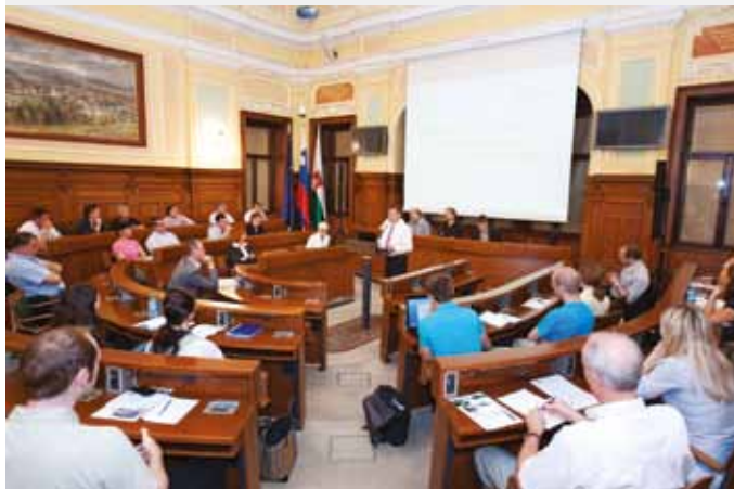
2nd dissemination workshop, april 2012

passengers outside the system of public passenger transport and do not generate new car users. It is important, then, not to erect large P + R points on the edge of the city, but preferably a great many small, locally sited points to a great extent accessible to users by bicycle or on foot. With this newly gained knowledge, we carried out a local workshop on P + R interchange points in the Ljubljana Urban Region. The workshop took place on April 12, 2012. A great number of participants corroborated the thesis that it is an urgent problem in the region, and that