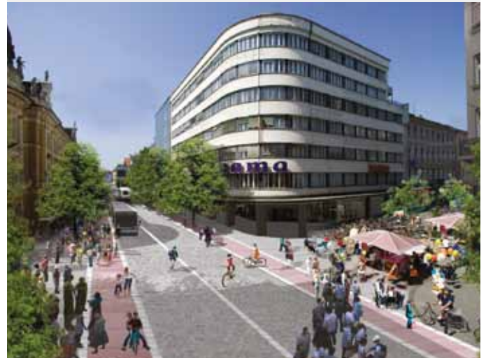
Photomontage of central part of Slovenska cesta closed for traffic

with various stakeholders and strengthened dialogue with citizens.