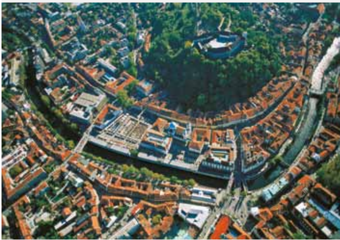
Old Town with Castle, Ljubljana, Metropolis

Metropolitan regions are economic leaders in development within their countries and across Europe. In order for them to become more competitive, metropolises and their surrounding regions must