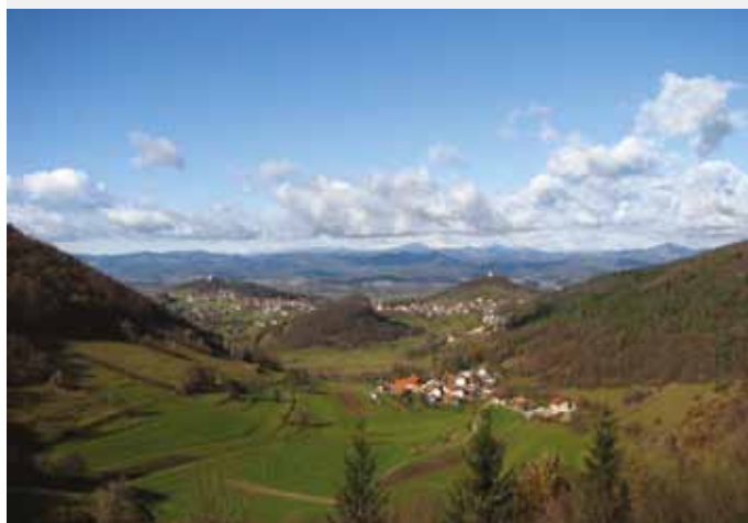
Municipality of Brezovica

Municipality of Brezovica, which is one of the 26 municipalities constituting the Ljubljana urban region, is located on the Southwestern part of the region. It is well connected to Ljubljana, since it lies just beyond the highway ring around Ljubljana, but it is nonetheless a very green municipality, with some well-developed touristic sites.