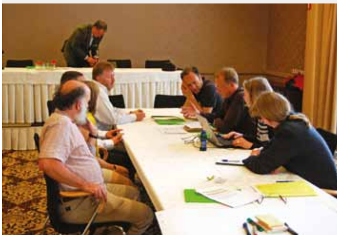
Working in groups