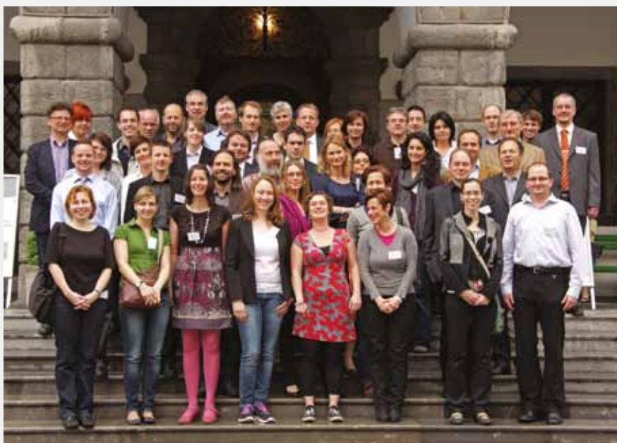
Participants at the Ljubljana workshop in May 2012

The workshop was hosted by 2 project partners: Anton Melik Geographical Institute of the Scientific Research Centre of the Slovenian Academy of Sciences and Arts and Regional Development Agency of Ljubljana Urban Region.