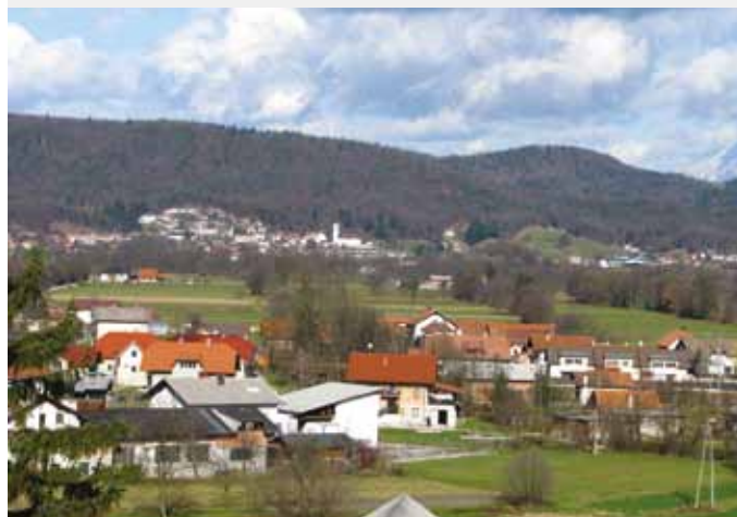
Municipality of Brezovica

railways stations in the municipality, with improved effects for public transport quality. With this package of measures, we have brought public transport closer to people and reduced its costs. The municipality also co-finances both bus lines towards the Ljubljana town. The result is an outstanding incre-