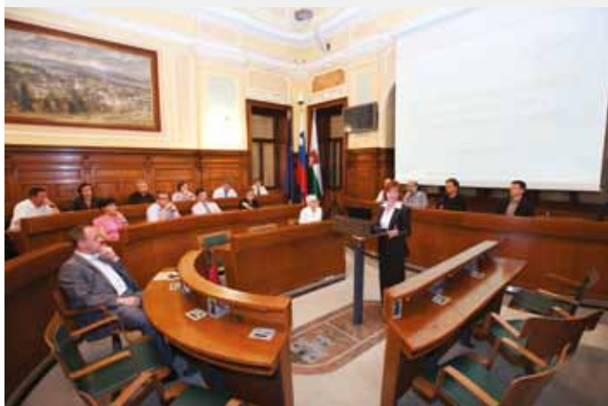
2nd dissemination workshop, april 2012

its residents and other stakeholders are eagerly awaiting effective solutions. At the workshop, the representatives of communes and the municipality, representatives of operators, research institutions, spatial planners and, of course, users of public transport systems confirmed the findings of the study "Expert guidelines for the regulation of regional public transport", the findings of the