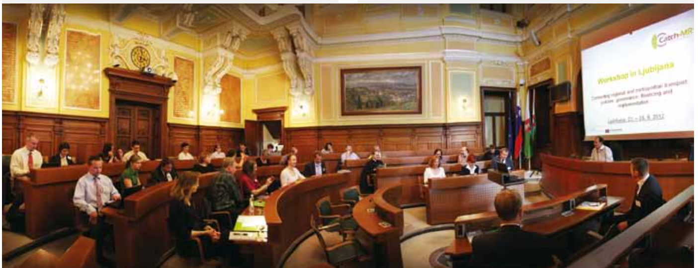
Day 1 – City Hall (City of Ljubljana)