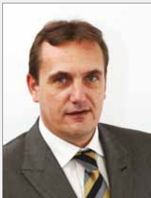
Metod Ropret, the Mayor of the Municipality of Brezovica

Municipality of Brezovica, which is one of the 26 municipalities constituting the Ljubljana urban region, is located on the Southwestern part of the region. It is well connected to Ljubljana, since it lies just beyond the highway ring around Ljubljana, but it is nonetheless a very green municipality, with some well-developed touristic sites.