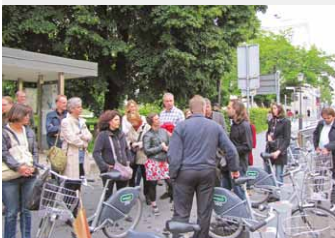
City bike system Bicike(LJ)

Evening was marked by the second site visit, this time dedicated to the city center of Ljubljana. The participants took a walk around the parts of the city dedicated to pedestrians. In an extensive programme of new pedestrian streets more than 20 streets in the city centre as well as several squares, including the large Congress square, were closed for traffic and renovated since 2006. The participants discussed also the very successful city bike system of Ljubljana.