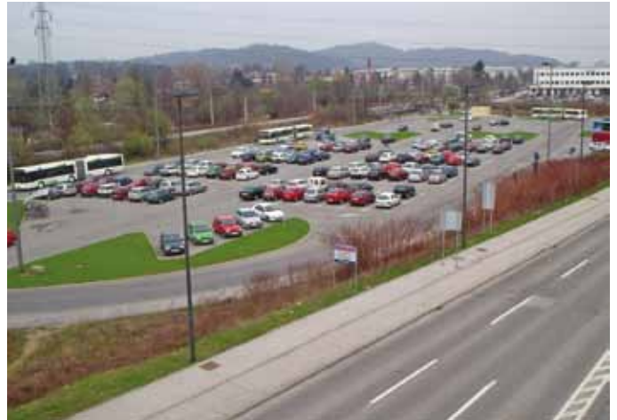
P+R Dolgi most

its residents and other stakeholders are eagerly awaiting effective solutions. At the workshop, the representatives of communes and the municipality, representatives of operators, research institutions, spatial planners and, of course, users of public transport systems confirmed the findings of the study "Expert guidelines for the regulation of regional public transport", the findings of the